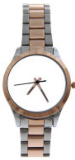
CODE : WA-25LP 30mm - Ladies Watch Printing Options : • Full Color logo on Dial • Metal Marking on Back