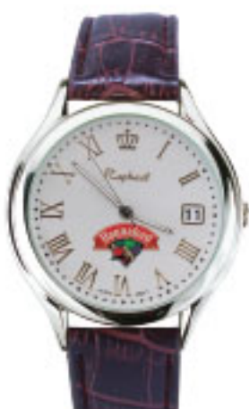
Full Color Logo on Ready Dials