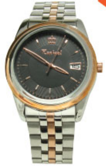
CODE : WA-24G 44mm - Gents Watch Printing Options : • Metal Marking on Back