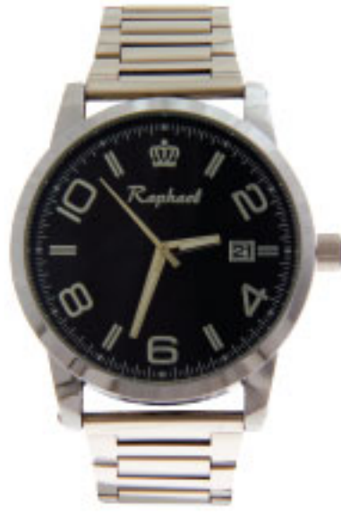
CODE : WA-21G 45mm - Gents Watch Printing Options : • Metal Marking on Back