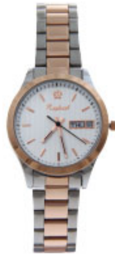
CODE : WA-25L 30mm - Ladies Watch Printing Options : • Full Color Logo on Dial • Metal Marking on Back