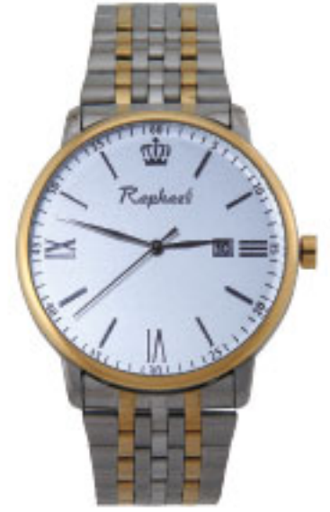
CODE : WA-12G 44mm - Gents Watch Printing Options : • Full Color Logo on Dial • Metal Marking on Back