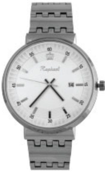
CODE : WA-16 46mm - Gents Watch Printing Options : • Metal Marking on Back