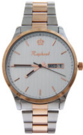
CODE : WA-25G 43mm - Gents Watch Printing Options : • Full Color Logo on Dial • Metal Marking on Back