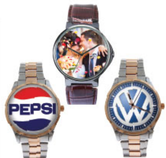
Costumized Photo Dials

ex. Commercial, Educational, Birthdays, Anniversaries & Wedding or Other types of Occassions.