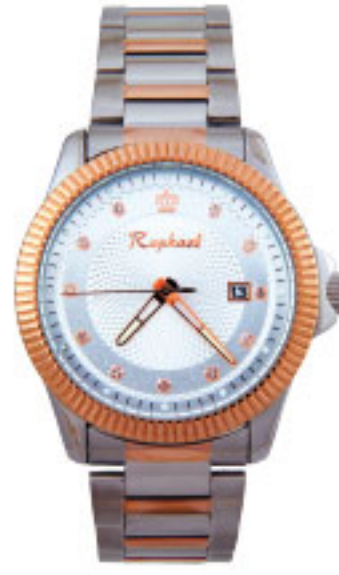
CODE : WA-22G 43mm - Gents Watch Printing Options : • Metal Marking on Back