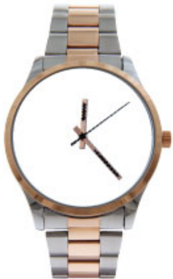
CODE : WA-25GP 43mm - Gents Watch Printing Options : • Full Color logo on Dial • Metal Marking on Back