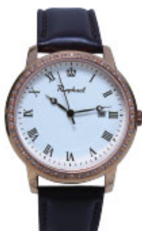
Laser Marking on Back Case