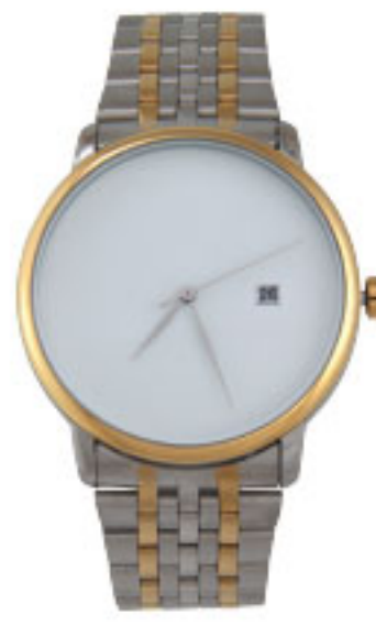
CODE : WA-12GP 44mm - Gents Watch Printing Options : • Full Color Logo on Dial • Metal Marking on Back